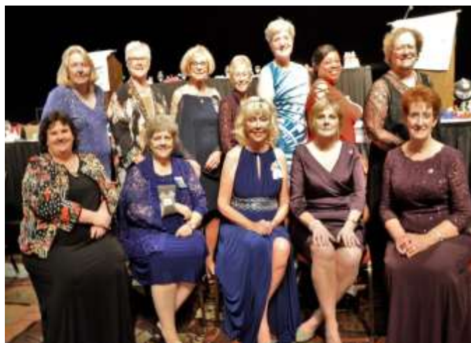
International Convention Installation Reno, Nevada – July 2, 2019