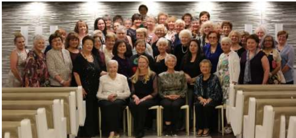
District Eleven Members at Convention July 2019